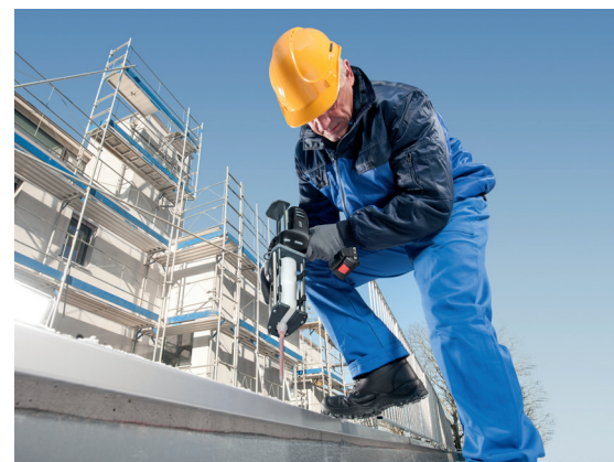
Figure 1: ecopaCC used for construction applications